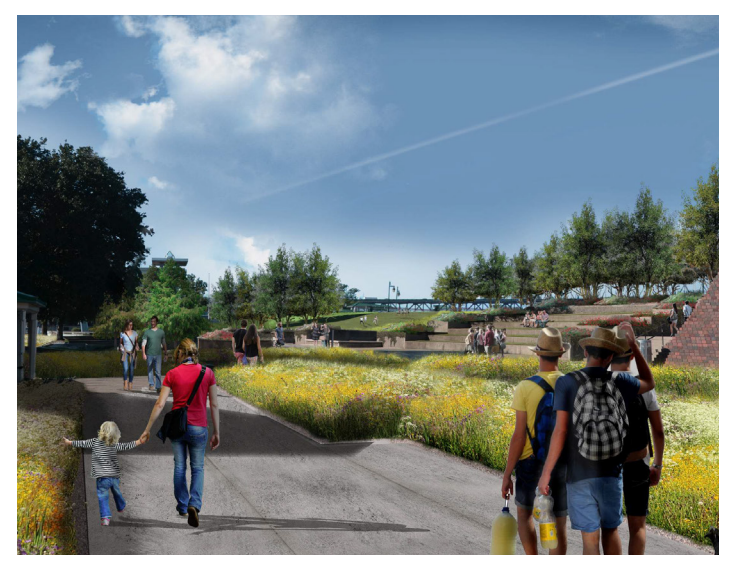
Riverfront Plaza: View South from Red Stick Sculpture