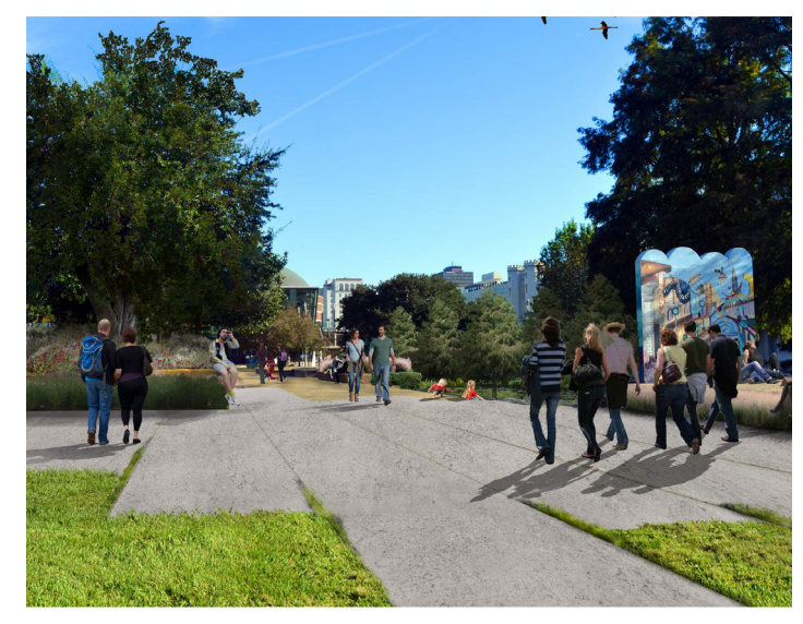
Riverfront Plaza: View North from Levee Stage Area