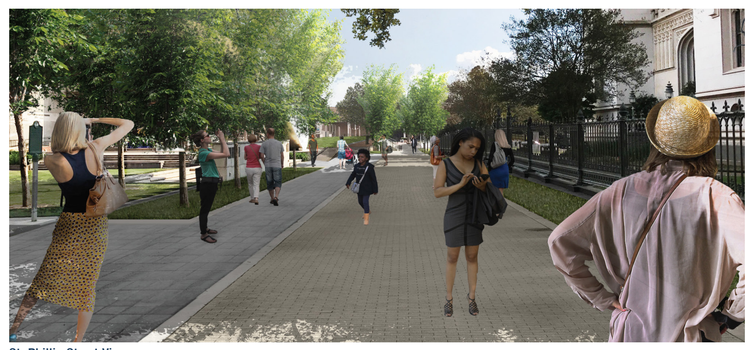
St. Phillip Street View

$1.8 million has been allocated for NBTS Phase II and will include corridor improvements along St. Phillip Street pedestrian promenade and North Boulevard. Beacon programming, event logistics, and landscape maintenance will continue to be managed by the DDD. Signage for Town Square has also recently been installed in and around NBTS to promote wayfiniding with the space and improve event logistics. Construction of North Boulevard Town Square Phase II is expected to be complete in the summer of 2019 and is being implemented by Gulf States Contractors.