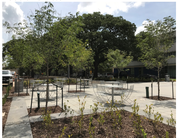
Fourth Street Plaza