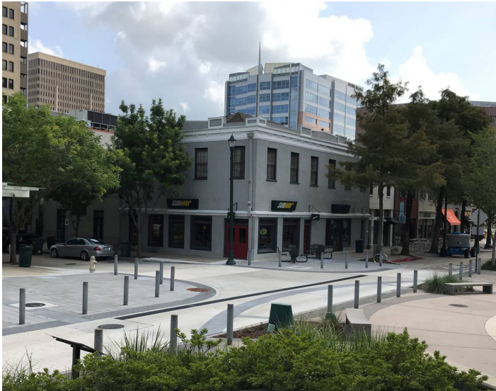
Curbless Intersection at North Blvd. & Third St.