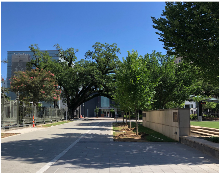
St. Philip Street Pedestrian Promenade