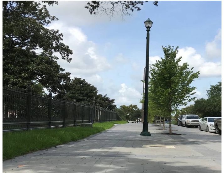
The Grand Promenade