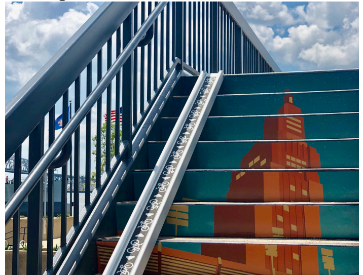
Pedestrian Bridge Bicycle Ramp and Welcome Graphic