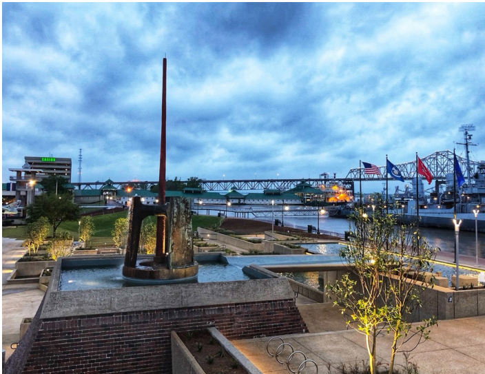
Redstick Landing & Sculpture