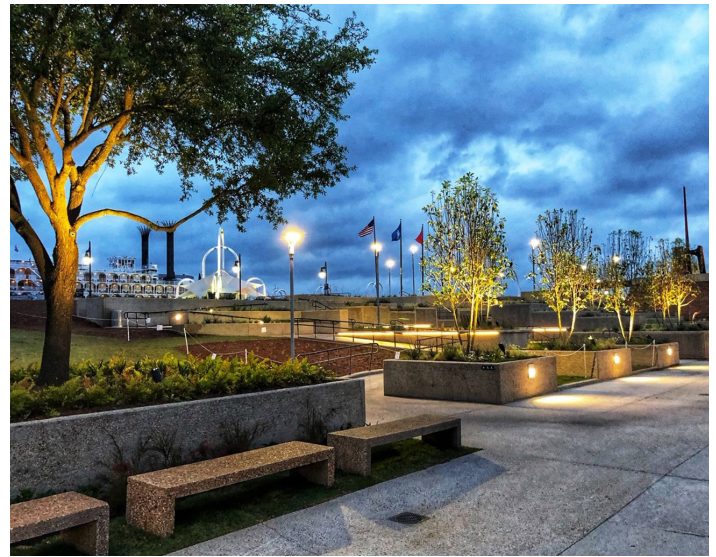
Levee Stage Area